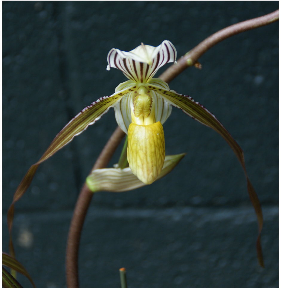
Paphiopedilum Crouching Tiger 'MBF' AM/AOS