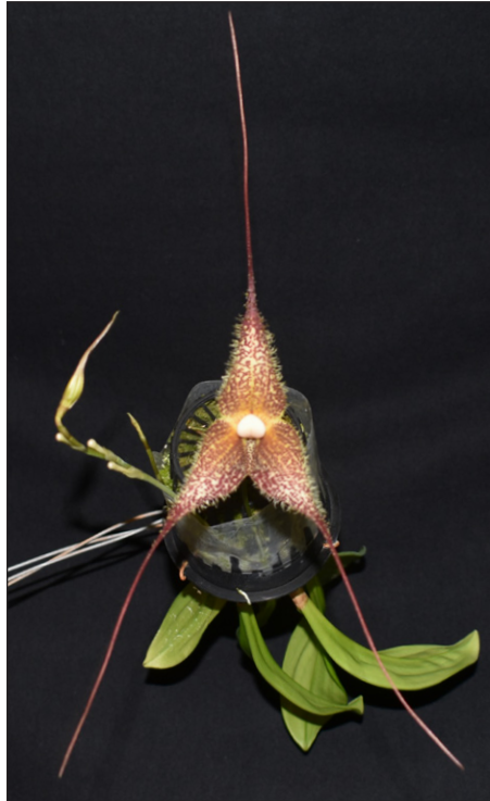
Dracula chimaera 'Nosferatu' AM/AOS