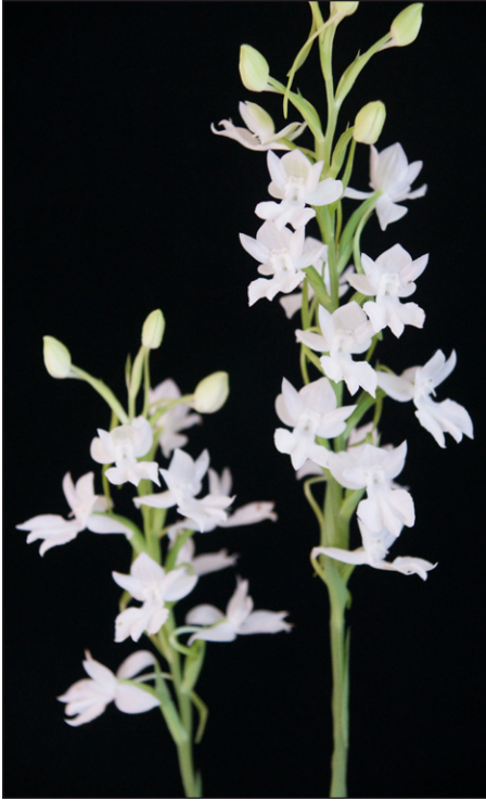
Pectabenaria Angelitas 'Memoria Sue Eloe' HCC/AOS