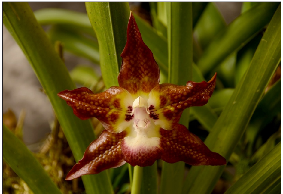
Huntleya burtii 'Ariel' FCC/AOS