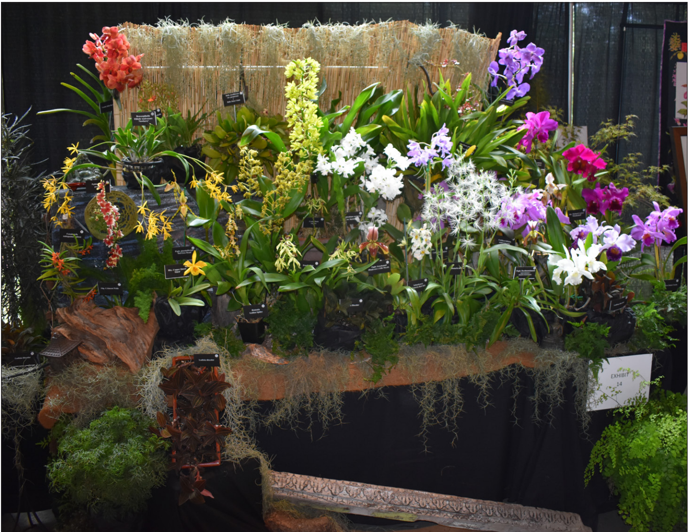
AOS Show Trophy, Smoky Mountain Orchid Society