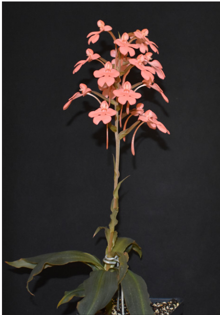
Habenaria Kakoeri 'Oxide II' AM/AOS