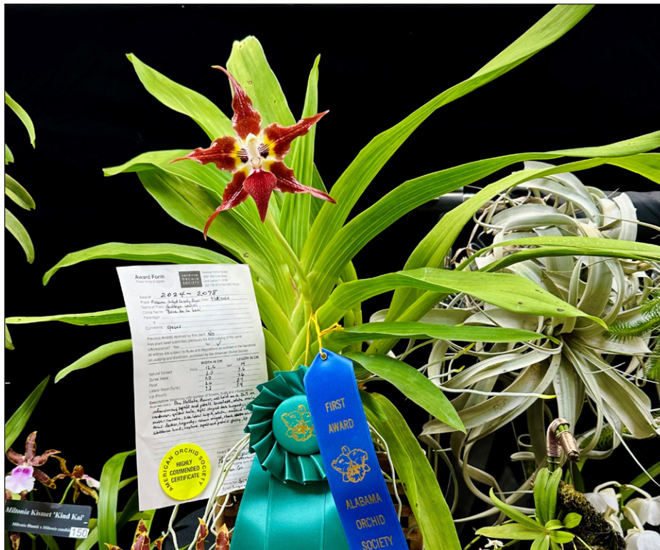
Huntleya wallisii ‘Boca de la boa’ HCC/AOS