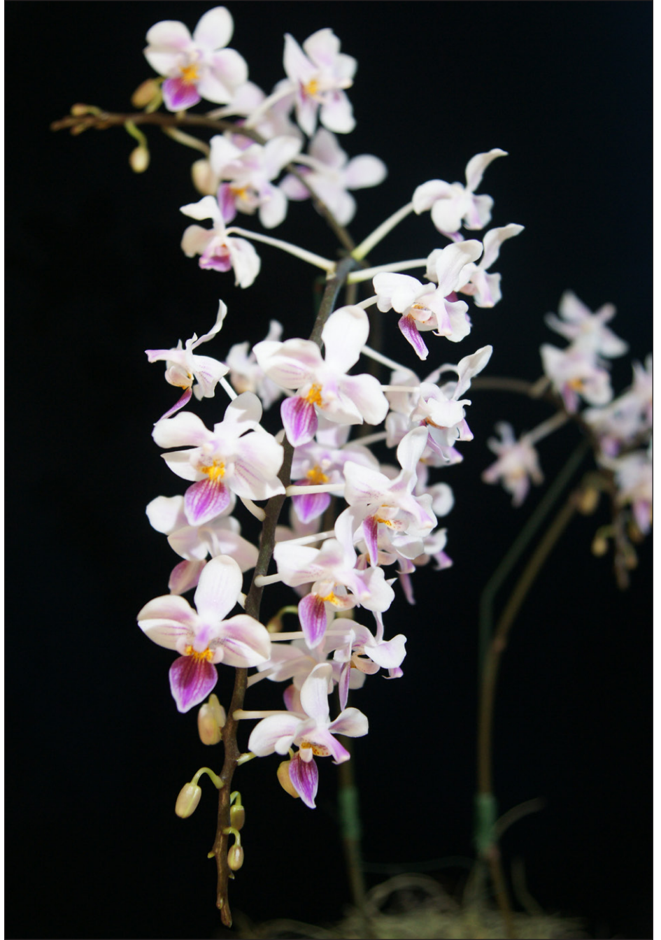
Phalaenopsis Connie Moody 'Newberry Delight' CCM/AOS