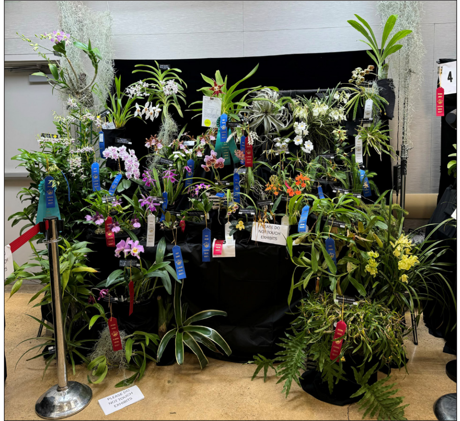
Atlanta Orchid Society exhibit