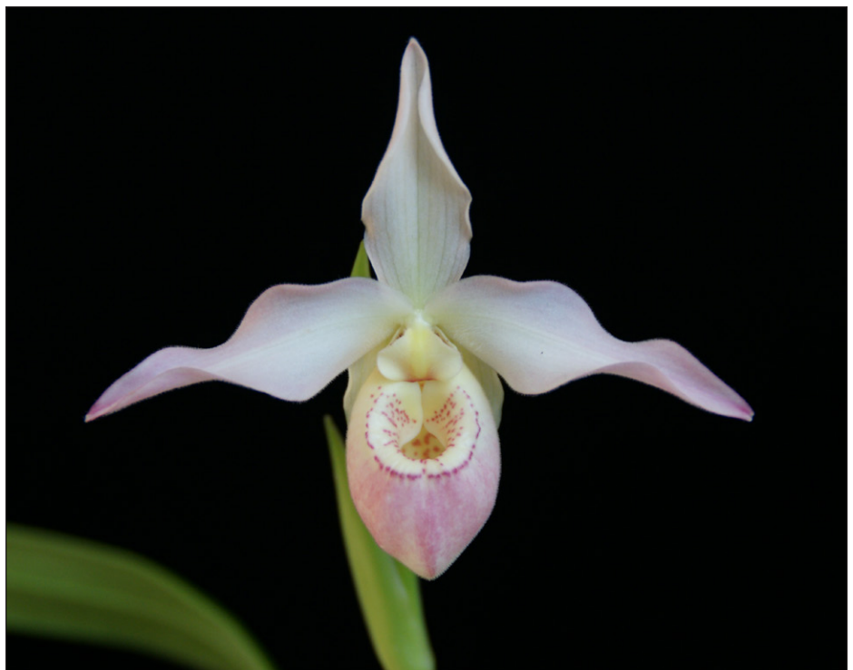
Phragmipedium Jeff Saal 'MaryAlice' AM/AOS