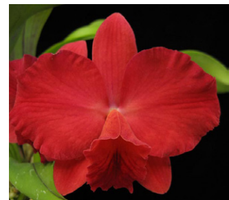
Pod parent, Cattleya Circle of Life.