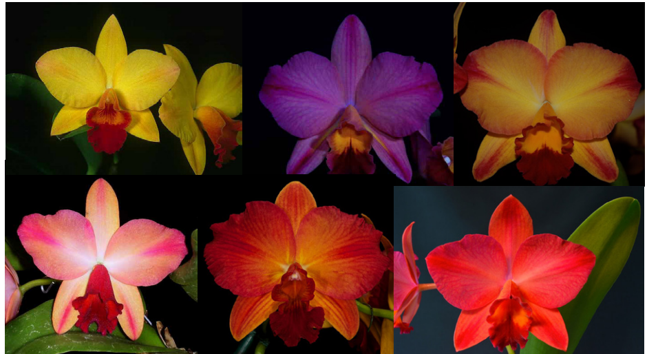
Various individual plants of the pollen parent of the pollen parent, Rhyncattleanthe Martha Clarke. Which one actually served as the grandparent of our seedlings is unknown.

I will bring the seedlings to this month's meeting, October 14, starting at